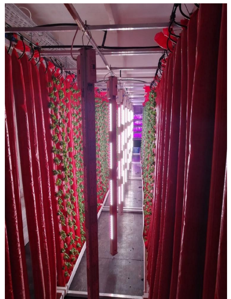
Picture 3. Incorrectly selected substrate and its packaging on a vertical farm

Phytosanitary control standards are not met on almost all vertical farms in Russia. When entering the "clean zone" on a vertical farm the worker must wear a dressing gown, special shoes, a hat, and gloves. Moreover, when entering the "Clean Zone" from the "Dirty Zone", one must thoroughly disinfect one's hands with an antibacterial agent and clean one's shoes on a special antibacterial mat.