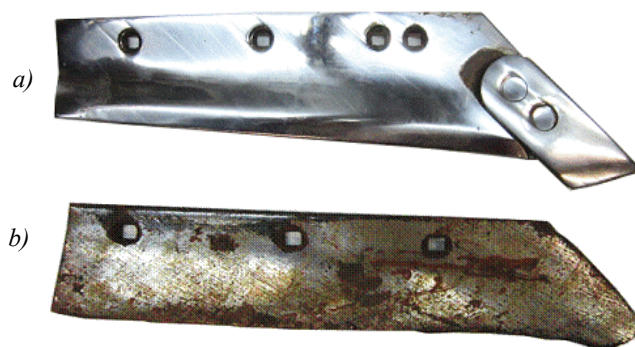
Fig. 2. Type of worn-out shares at the end of tests: a) experimental composite ploughshare; b) conventional П702 ploughshare

depth after operating an area of 3...5 hectares, and from time to time it was necessary to restore it by adjusting the support wheel – even at a critical state when the plough deepening process became irreversible (the ploughshares completely lost their performance).